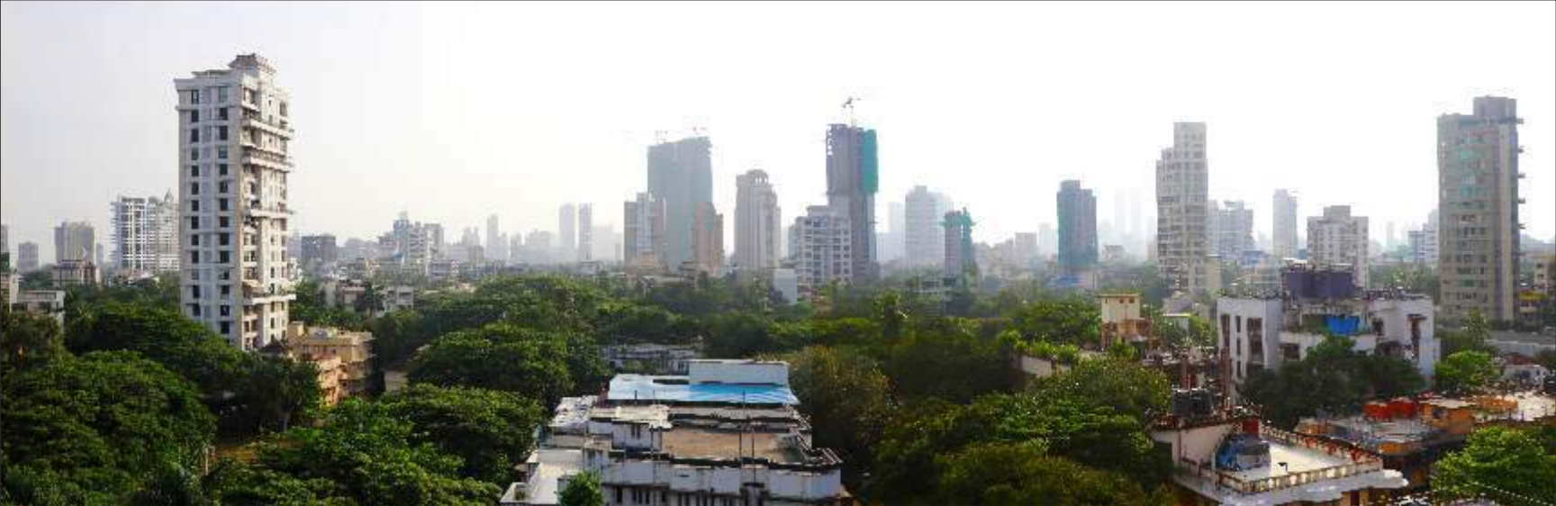
Actual view from site