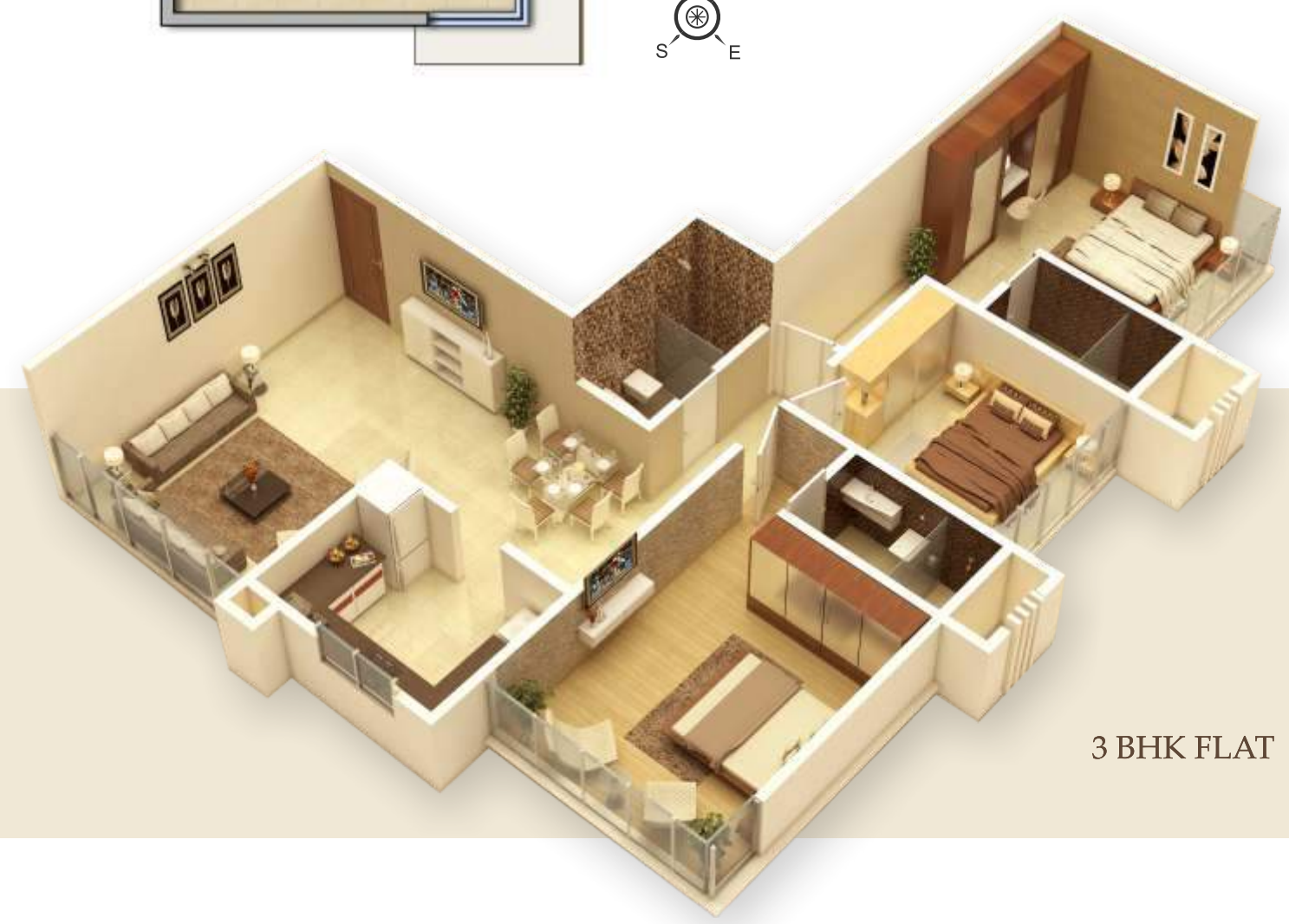
3 BHK FLAT