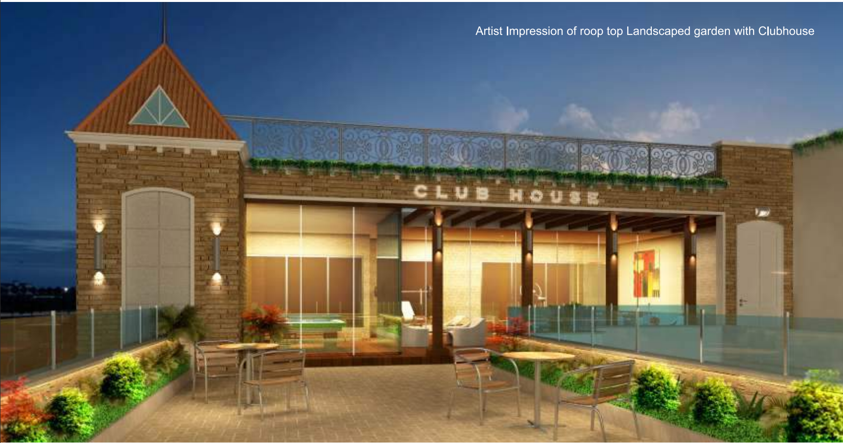
Artist Impression of roof top Landscaped garden with Clubhouse